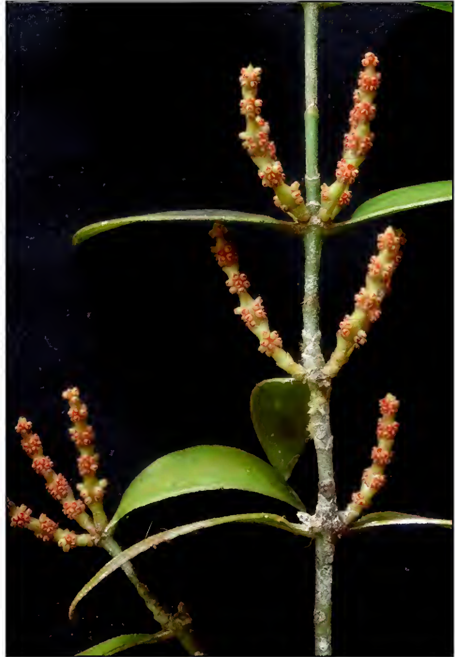
Fig. 3. Flowers and inflorescences of the type of Dendrophthora perlicarpa .